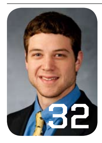
JIMMER FREDETTE 6-2 • 190 • Senior • Guard Glens Falls, N.Y. / Glens Falls HS

LAST GAME: Posted a near triple-double vs. UTEP with 25 points, 8 rebounds and 9 assists.