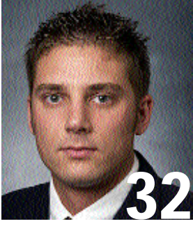
6-9, So., Forward