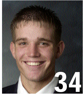
6-8, So., Forward