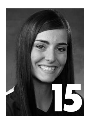
Season and Career Highs

Games played: 30 Kills per game: 0.57 Hitting Pct: .387 Assists per game: 13.27 Aces per game: 0.27 Digs per game: 1.83 Blocks per game: 0.63