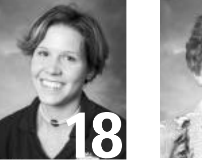
6-0, Fr., MB