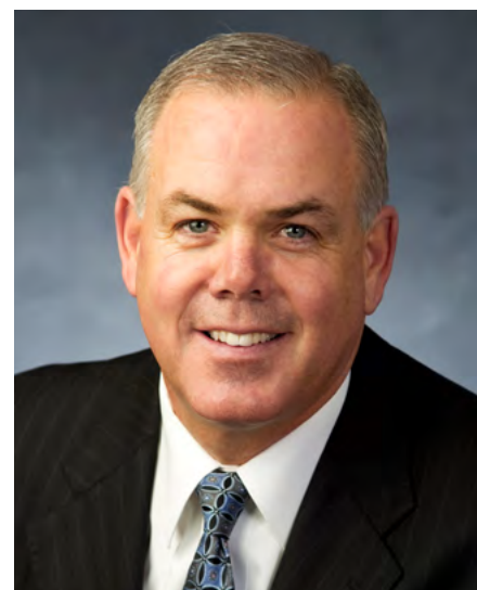
Scan to view Rose's profile on BYUcougars.com