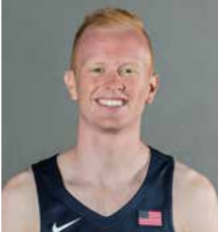
ALPINE, UTAH LONE PEAK HS