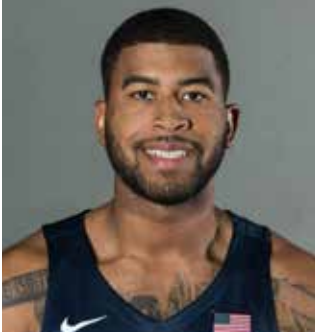
HOUSTON, TEXAS HOUSTON