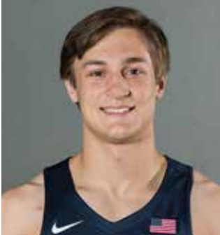
RICHLAND, WASHINGTON RICHLAND HS

2016-17 SEASON — PPG: 2.3 RPG: 1.1 APG: 0.8 BPG: 0.0 SPG: 0.4 FG%: .476 3FG%: .500 FT%: .333