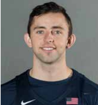
ALPINE, UTAH LONE PEAK HS

2016-17 SEASON — PPG: 15.7 RPG: 3.6 APG: 3.0 BPG 0.3 SPG 1.9 FG%: .418 3FG%: .379 FT%: .865